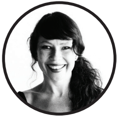
Choreography by Tara Gower