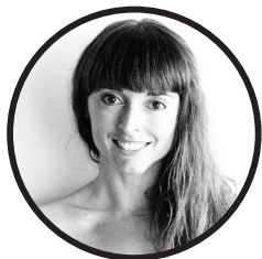
Choreography by Yolande Brown

In an intimate exploration of the waters of the Torres Strait, and those brave enough to risk their lives at the depths of the ocean, this dance film takes a brief look at the athleticism and stamina of two divers who put their lives on the line in search of the treasured pearl shells.